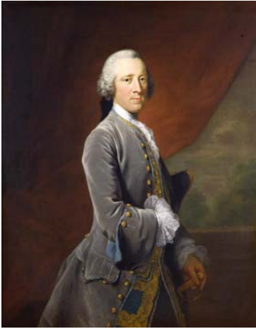
William Cavendish, 4th Duke of Devonshire, (1720 - 64).