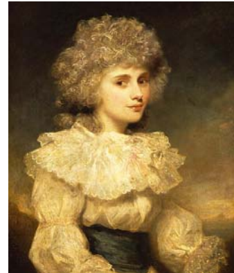
Lady Elizabeth Foster, (c.1759 - 1824).

The 5th Duke married Lady Georgiana Spencer, famous for her charm and beloved by all who knew her. She and her great friend Lady Elizabeth Foster were painted several times by Sir Joshua Reynolds and Thomas Gainsborough. Lady Elizabeth became the mistress of the Duke, and had two children by him. Curiously enough, this did not interfere with her friendship with Georgiana. The ménage à trois continued for some years and has been the subject of many books.