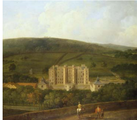
Elizabethan Chatsworth (detail), By Richard Wilson (1713 – 82), after a lost original.

The first house at Chatsworth was built by 'Bess of Hardwick' and her second husband Sir William Cavendish. They bought the manor of Chatsworth in 1549 and began to build in 1552. The Hunting Tower, created in the 1580s, still stands on the hill behind Chatsworth. Bess had four husbands but only had children by Sir William. Their second son, William, became his mother's heir and bought Chatsworth from his older brother, Henry. William was made Baron Cavendish in 1605 and created Earl of Devonshire in 1618.