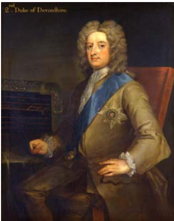
William Cavendish, 2 nd Duke of Devonshire, (1673 – 1729).