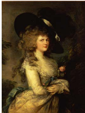
Lady Georgiana Spencer, (1757 - 1806).