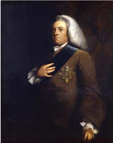
William Cavendish, 3 rd Duke of Devonshire, (1698 – 1755).