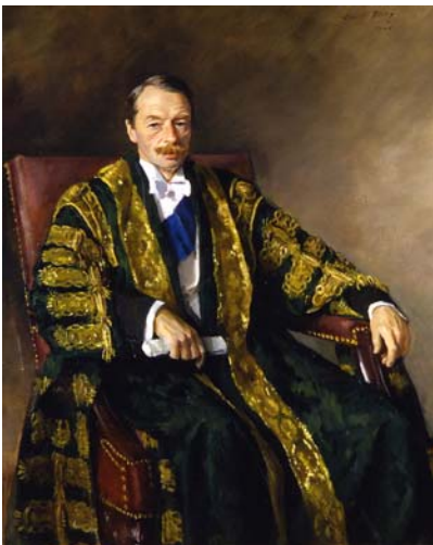
Victor Cavendish, 10th Duke of Devonshire, (1895 - 1950).