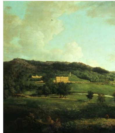
View of Chatsworth (1770), by William Marlow.

The 3rd Duke served for seven years as Lord Lieutenant of Ireland and was Member of Parliament from 1721 until his father's death sent him to the House of Lords in 1729. The Prime Minister Sir Robert Walpole was a friend of his and his father, and the Van Dyck portrait of Arthur Goodwin which hangs in the Great Dining Room came from Walpole's collection. When Devonshire House in Piccadilly was burnt down in 1733, the Duke commissioned William Kent to rebuild and furnish it. Much of Kent's furniture for Devonshire House is now at Chatsworth.