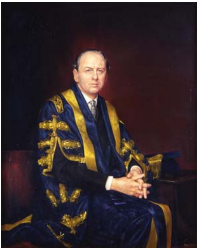
Andrew Cavendish, 11th Duke of Devonshire, (1920 - 2004).