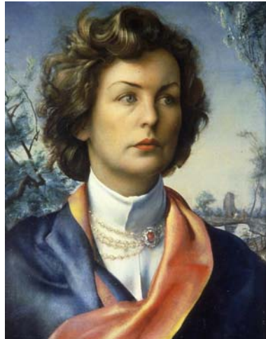
Hon. Deborah Mitford, (b. 1920).

Andrew Robert Buxton Cavendish, KG, PC, MC. 11th Duke of Devonshire married the Hon. Deborah Mitford, daughter of Lord Redesdale, in 1941. He served in the Coldstream Guards during the war, and was Mayor of Buxton 1952-54. Later he was a minister in the Conservative government 1960-64.