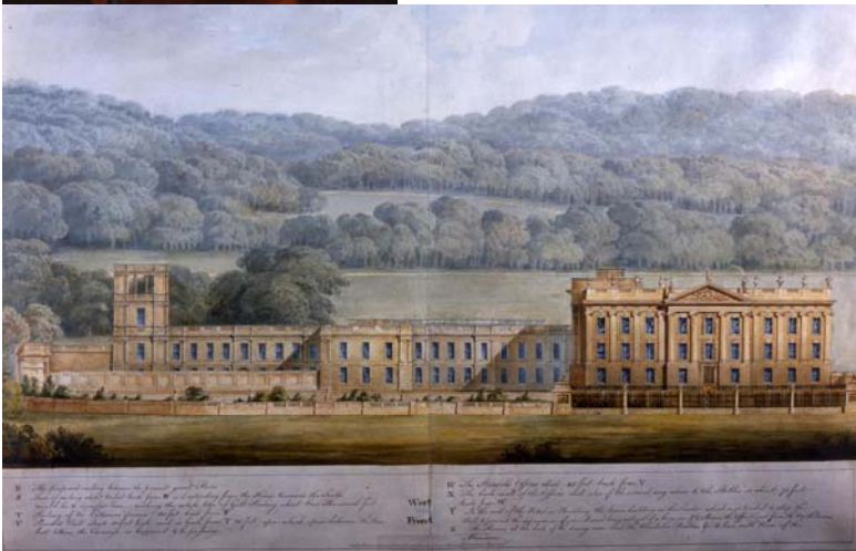
William Spencer Cavendish, 6th Duke of Devonshire, (1790 - 1858), Elevation of 6 th Duke's north wing, Sir Jeffry Wyattville (1766 - 1840).

The 6th, 'Bachelor', Duke was Duchess Georgiana's only son and succeeded his father at the age of 21. Extravagant and charming, he was a prince of hosts. He never married but loved entertaining his friends and spent 47 years improving his many houses and collecting objects of every kind with which to embellish them. He bought two complete libraries, many paintings and sculptures and a great deal more besides. He engaged the architect Sir Jeffry Wyattville (1766-1840) to build the long North Wing at Chatsworth. Later, Lismore Castle in County Waterford was also rebuilt. Such expenditure taxed even his resources and he was forced to sell