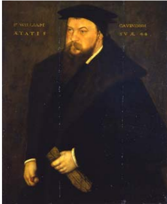
Sir William Cavendish, (1505 – 57).