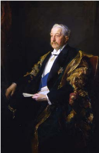
Victor Cavendish, 9th Duke of Devonshire, (1868 - 1938).