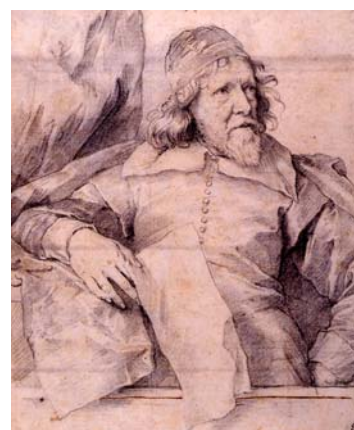
Inigo Jones , drawing by Anthony van Dyck, collected by the 2 nd Duke.

The 2nd Duke made no changes to the house and garden he had watched being created in his youth. He made his mark in a different field, as a collector of paintings, drawings and prints. He also made important collections of coins and carved Greek and Roman gems. The Duke was the grandfather of Henry Cavendish (1731-1810), the distinguished and eccentric scientist, who determined the composition of water, recognised hydrogen as an element and was 'the first man to