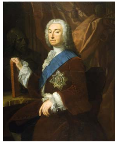
Richard Boyle, 3 rd Earl of Burlington, (c.1694 – 1753).

The 4th Duke was a prominent Whig politician like his father, serving as Lord Lieutenant of Ireland and Prime Minister of England (November 1756 - May 1757). He made great changes to the park and garden. He decided that the house should be approached from the west, so he pulled down the old stables and offices which interfered with the view on this side, and razed the cottages of Edensor village which were visible from the house. The architect James Paine (c. 1716-89) was commissioned to build new stables up the slope to the north-east (completed in 1763). The course of the river was altered and Paine designed a new bridge upstream of the house (1762). Land to the west of the river, including what remained of Edensor village was enclosed to become the park as it is today. Lancelot (Capability) Brown (1716-83) was engaged to destroy most of the 1st Duke's formal garden and to give the park the natural, romantic look which he had helped bring into fashion.