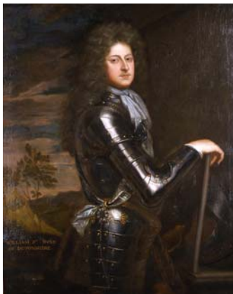
William Cavendish, 1 st Duke of Devonshire, (1640 – 1707).