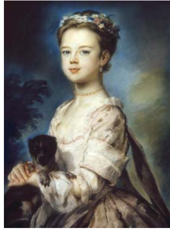
Lady Charlotte Boyle, (1731 – 54).