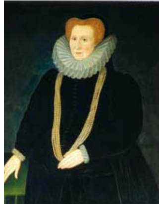
Bess of Hardwick, (c.1527 – 1608).