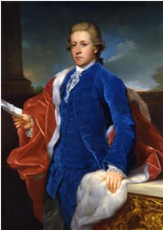
William Cavendish, 5th Duke of Devonshire, (1748 - 1811).