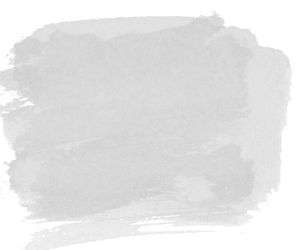
Investigate the object Draw the inside