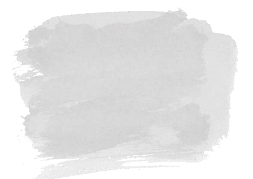
Draw a small section Zoom in & look closely

Grab a piece of fruit or vegetable from the kitchen and use the spaces below to draw the same object using the different looking techniques. Search for Elisabeth Frink online to find out more about how she looks at the objects she draws and sculpts.