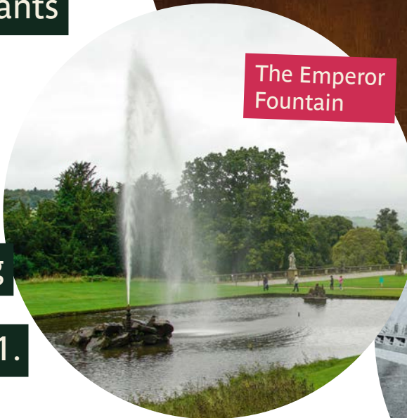
The Emperor Fountain

He is also famous for designing The Crystal Palace in London for the Great Exhibition in 1851.